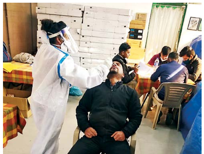
RT-PCR Tests conducted for Staff and Members from 11-13 Nov 2021. 507 people were tested

On 8 January 2022, the weekend curfew was announced. During this crucial period, the Club followed proper Government guidelines and managed its functioning with limited staff and with no halt of any essential services. A continuous practice was proper daily sanitization after regular intervals. The Club made it easier for club employees and staff/labour of the contractors to work together during the weekend curfew by providing lodging and food services to about 60-70 club staff and contractor's labour, while they continued work on three key separate projects, the renovation of the Pub, renovation of the Gym and the Water Treatment Plant's project work.