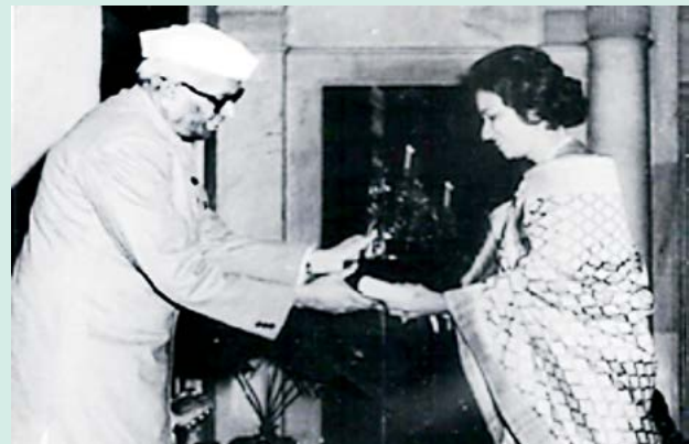
Receiving the Arjuna Award