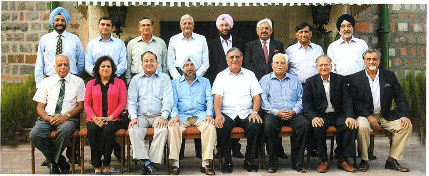
GENERAL COMMITTEE 2012-2013